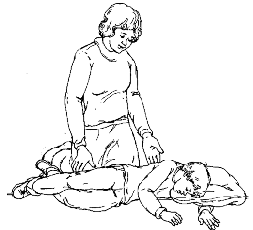
Picture 1 Turn your child's head to the side and point the face downward.